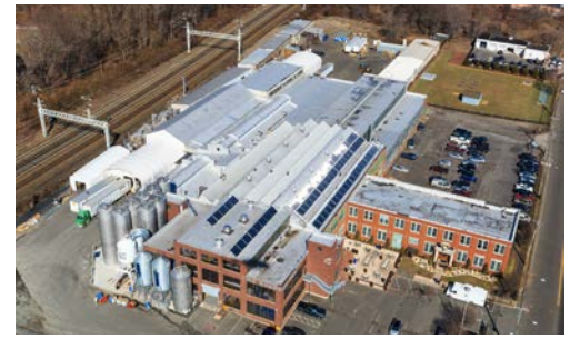
Two Roads Brewing Company located in Stratford, Connecticut modernized their lighting to capture energy savings and convenience.