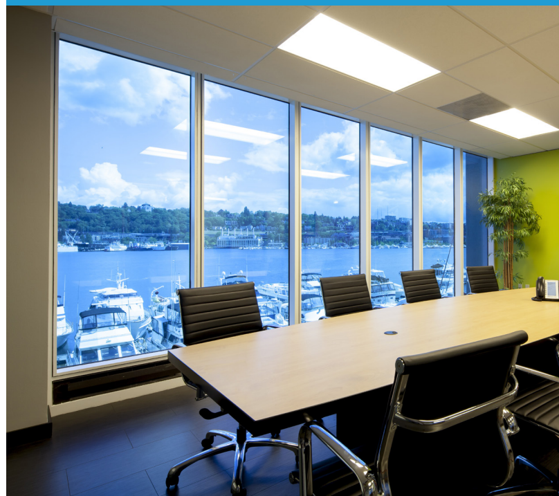
Pictured above: Lake Union, Wash. office building with secondary window upgrade