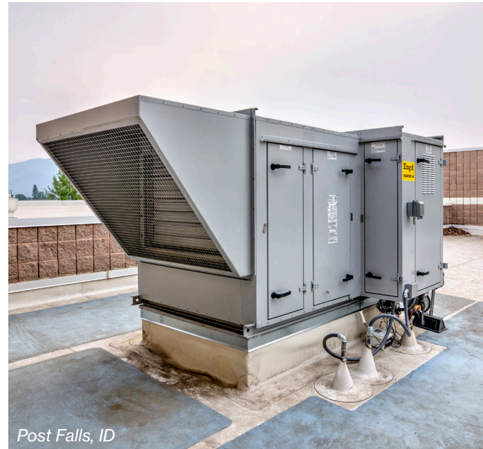
Post Falls, ID