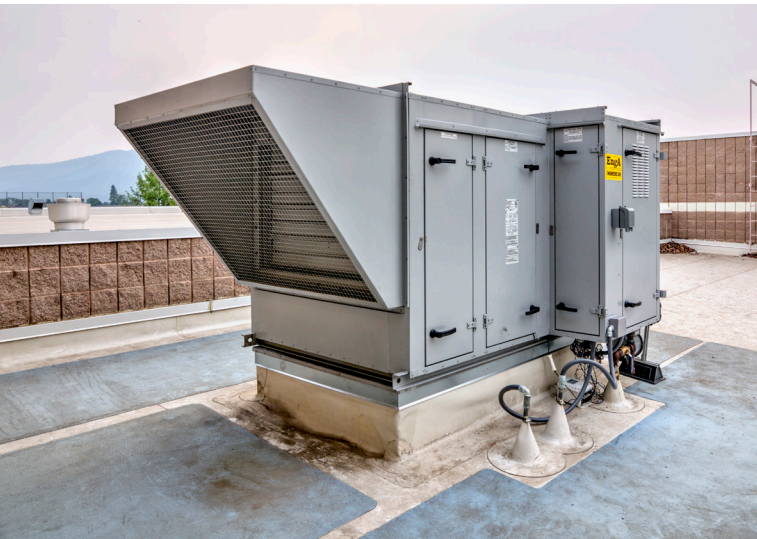
Post Falls, ID

T his guide references code requirements, manufacturer instructions and practical experience to provide tips and best practices for installing C-RTUs.