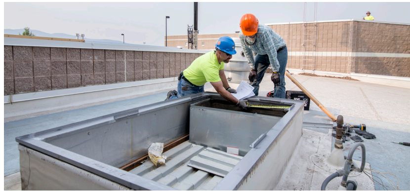
Post Falls, ID